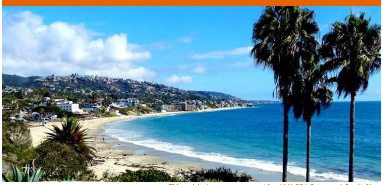
This activity has been approved for AMA PRA Category 1 Credits™.